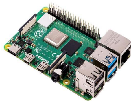
Fig 5:Raspberry Pi

Raspberry Pi is a chain of little computer develop with inside the United Kingdom through the Raspberry Pi Foundation in hyperlink with Broadcom. The Raspberry Pi venture at first leaned closer to the furthering of coaching primary laptop technological know-how in colleges and in evolve countries. The unique version have become extra famous than excepted, promoting outdoor its goal marketplace for makes use of including sensible retrieval. It is commonly used in lots of areas, including for climate monitoring, due to its low cost, compatible, and open design. It is consultant utilized by laptop and digital layman, because of its assumption of HDMI and USB devices.