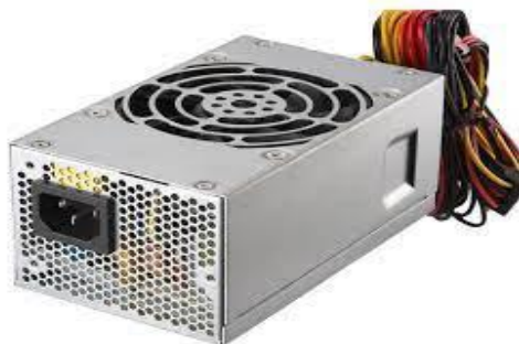
Fig 4:Power Supply

A power supply is an electrical device that supplies electrical energy to an electrical load. The primary purpose of a power supply is to change the electrical current from a spring to the correct voltage, current, and frequency to power the load. Therefore, power packs are sometimes also referred to as electrical power converters. Some power providers are separate, standalone devices, while others are built into the chargers that power them. Examples of the latter are power supplies found in desktop computers and consumer electronics.