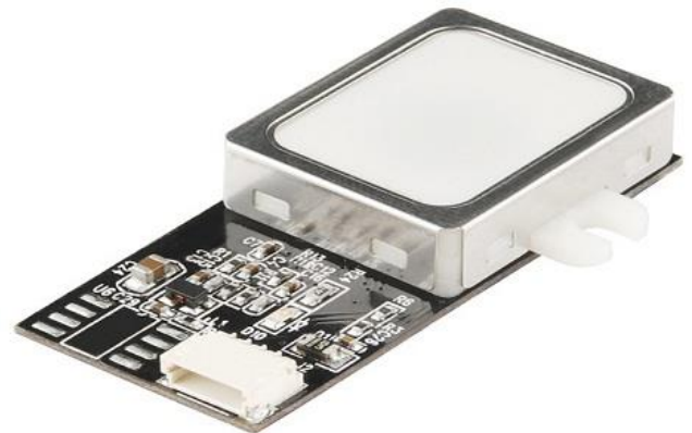
Fig 6:Fingerprint Module

It is a type of sensor used in a fingerprint recognition device. Most of these devices are embedded with fingerprint recognition program and are used for computer security. The main features of this device mainly include correction, better production and robustness based on full fingerprint biometric technology. Both the fingerprint scanner and reader are an exceptionally secure device, more suited to security than a secret word. Because the password is easy to learn, and is also difficult to remember