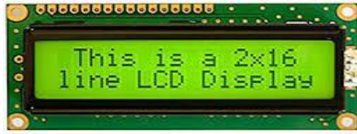
Fig 7:LCD display

applied to the transparent zinc anode, the liquid crystal crumb aligns parallel to the glass surface.