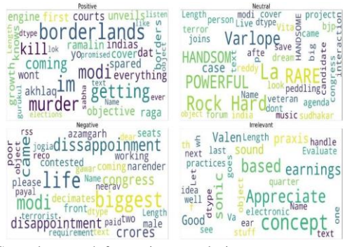
Fig. 2. General approach for sentiment analysis