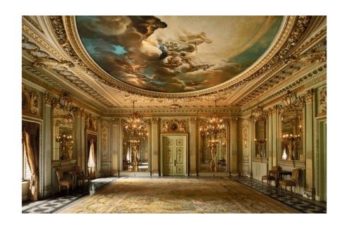
Lalbagh Palace Inside