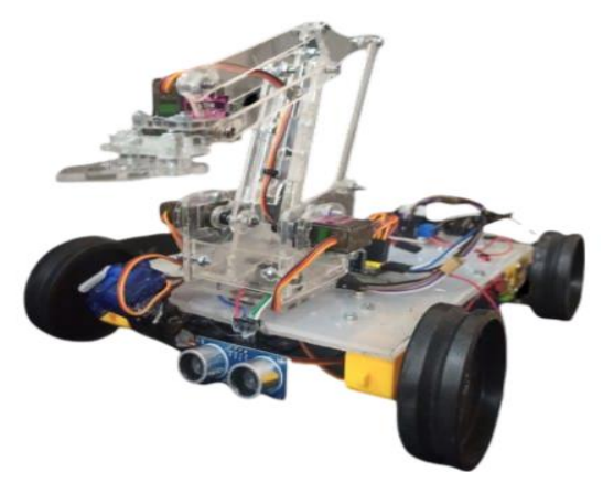
6.1 Proposed result

The culmination of the project yields a groundbreaking achievement in the realm of robotics—a highly sophisticated AI-driven rover system, meticulously engineered with a versatile robotic arm, and powered by Raspberry Pi technology. This culmination signifies a significant leap forward in autonomous robotics, as the rover seamlessly navigates its surroundings, adeptly avoiding obstacles and executing precise movements. Equipped with cutting-edge computer vision algorithms, the rover perceives and interprets its environment in real-time, allowing for dynamic decision-making and adaptive behavior. Moreover, the integration of a robust robotic arm enhances the rover's capabilities, enabling it to manipulate objects with remarkable precision and agility. Through extensive testing and refinement, the project attains a pinnacle of performance and reliability, poised to revolutionize various domains—from scientific exploration to industrial automation. As a testament to innovation and ingenuity, the project underscores the transformative potential of AI-driven robotics, propelling the boundaries of technological advancement into uncharted territories.