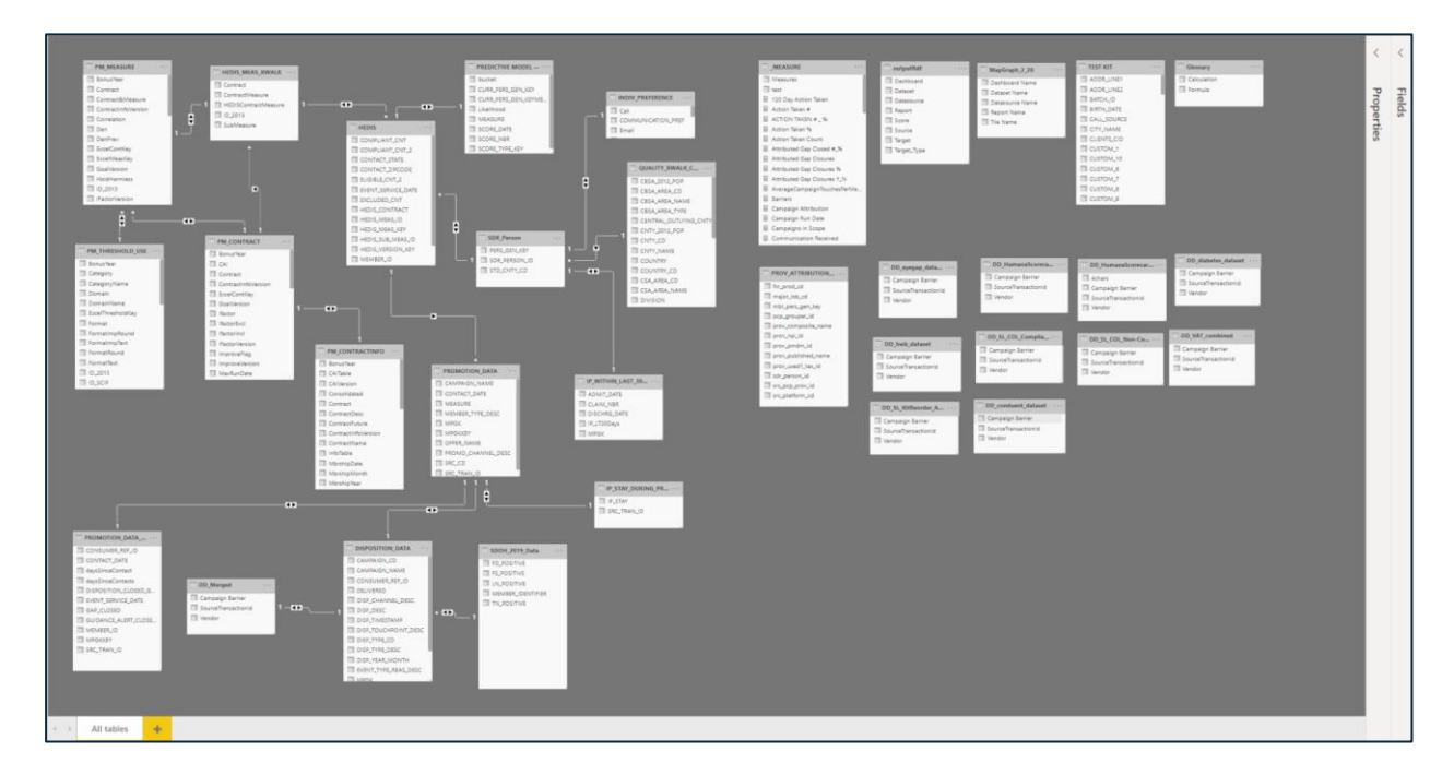
Fig.2: Data model for Stars reporting

• Datasets such as Healthcare Effectiveness Data and Information Set (HEDIS), Social Determinants of Health (SDOH), Practice Management (PM) ingested and transformed based on KPI needs.