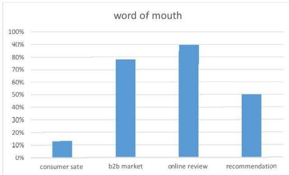
Top 5 Marketing Trends in 2022: What trends are you currently leveraging?