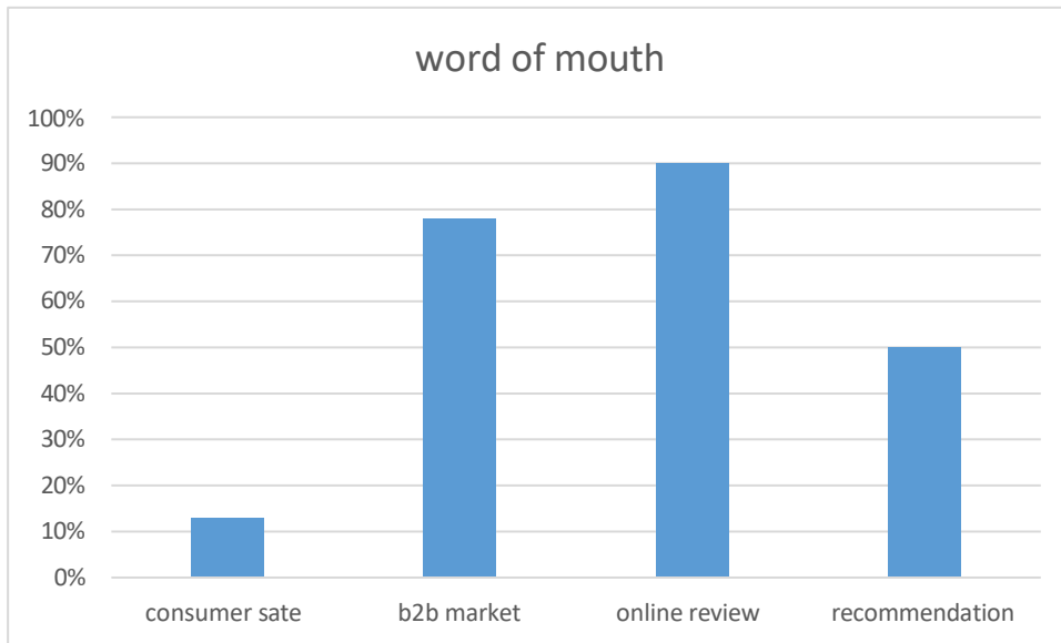
Top 5 Marketing Trends in 2022: What trends are you currently leveraging?