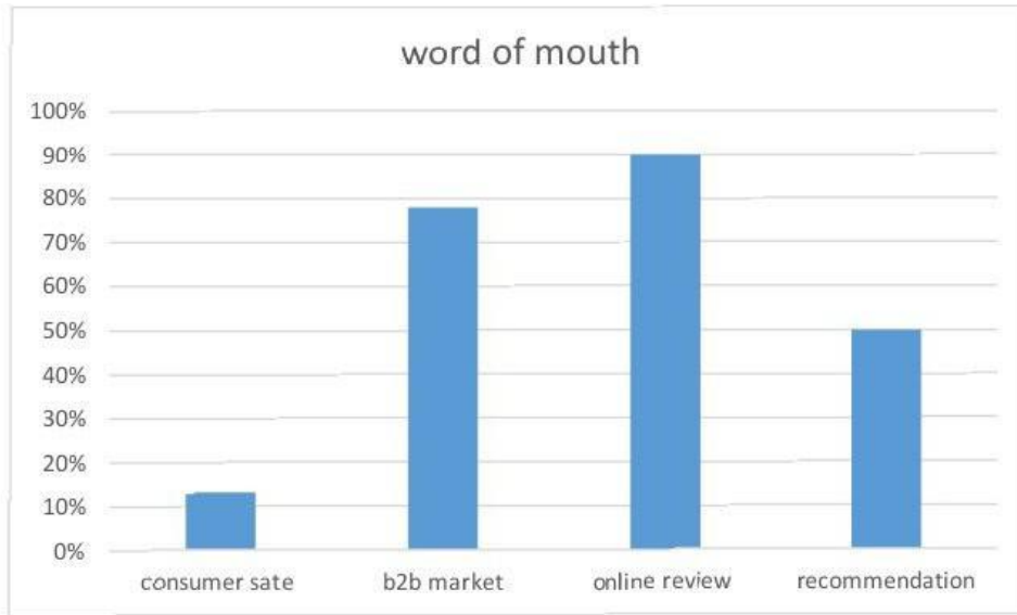
Top 5 Marketing Trends in 2022: What trends are you currently leveraging?