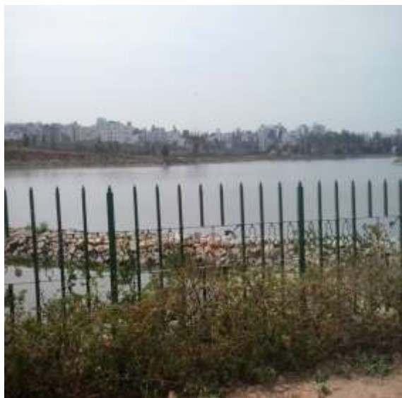
Figure 2: Residential flats on the periphery of the Lake