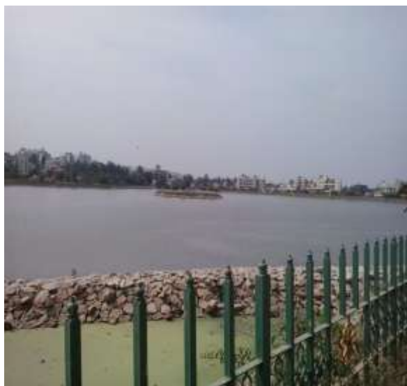
Figure 4: Algal growth in the Lake