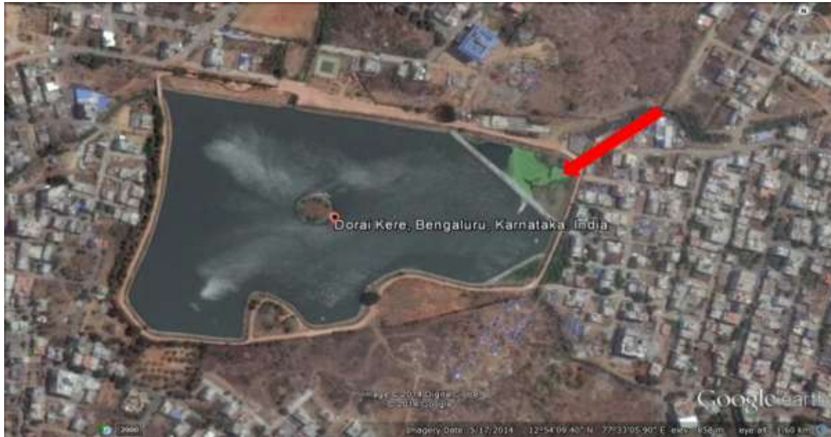
Figure 1: The satellite photo of Dorekere Lake and its surrounding area with sewage entry point.