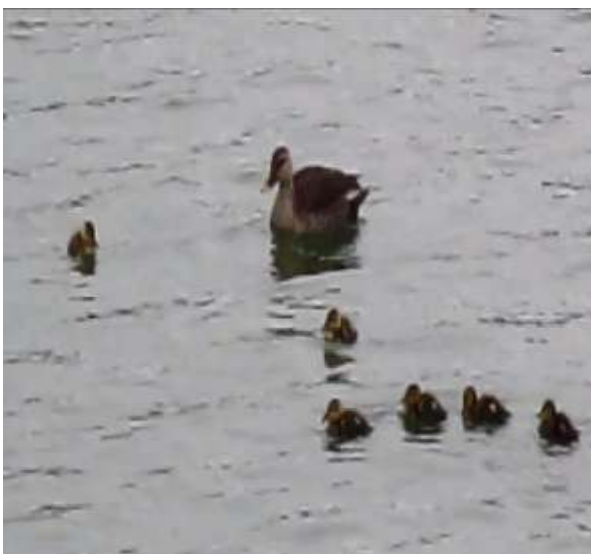
Figure 5: SPOT-BILLED DUCKS AT DOREKERE