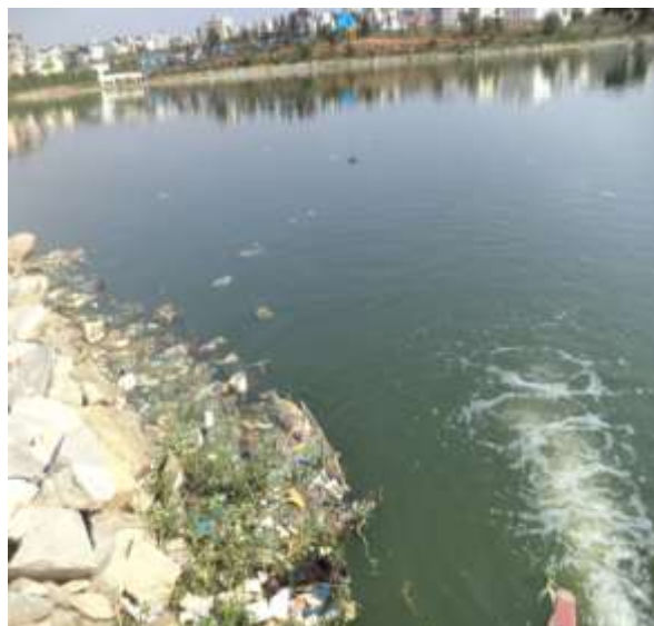
Figure 3: Discharge of Municipal sewage