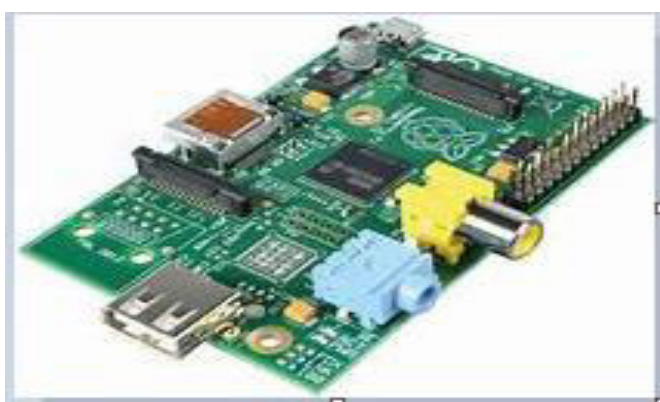
Fig -1: Raspberry Pi OS

Raspberry Pi is minimal effort, fundamental PC that was initially expected to help goad enthusiasm for figuring among school-matured kids. The Raspberry Pi is contained on a solitary circuit board and highlights ports for: HDMI. Indeed, even the product, by prudence of being open-source, offers an open door for understudies to investigate the basic code - on the off chance that they wish. The Raspberry Pi is accepted to be a perfect learning apparatus, in that it is modest to make, simple to supplant and needs just a console and a TV to run. These equivalent qualities likewise make it a perfect item to kick off figuring in the creating scene.