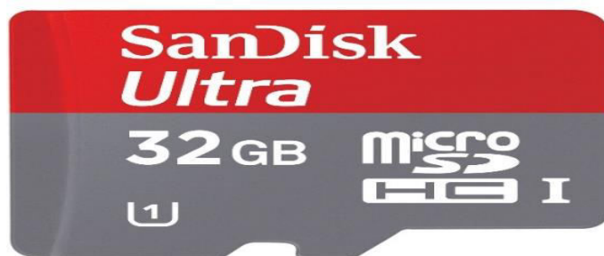
Fig -2: SD Card

The SD card is a key piece of the Raspberry Pi. It gives the underlying stockpiling to the Operating System and documents. Capacity can be stretched out through numerous kinds of USB associated peripherals. At the point when the Raspberry Pi is 'exchanged on', for example associated with a power supply, an exceptional bit of code called the boot loader is executed, which peruses increasingly unique code from the SD card that is utilized to fire up the Raspberry Pi. On the off chance that there is no SD card embedded, it won't begin. Try not to push in or haul out a SD card while the Raspberry Pi is associated with the power, as this is probably going to degenerate the SD card information (you may pull off it, yet it is best not to). The SD card must be designed, or written to, extraordinarily that implies the Raspberry Pi can peruse the information it needs to begin appropriately. In the event that you are new to this check the guidelines, or purchase a pre-organized SD card. One preferred standpoint to utilizing a SD card like this is you can have a few SD cards, each with an alternate working framework, or an alternate reason. Just power off, switch cards, and reconnect the power. You have an alternate PC to play with. If it's not too much trouble remember that the greatest throughput of the card per user of the Raspberry Pi is 25 MB/s and that in all likelihood read and compose speed won't surpass 22 MB/s.