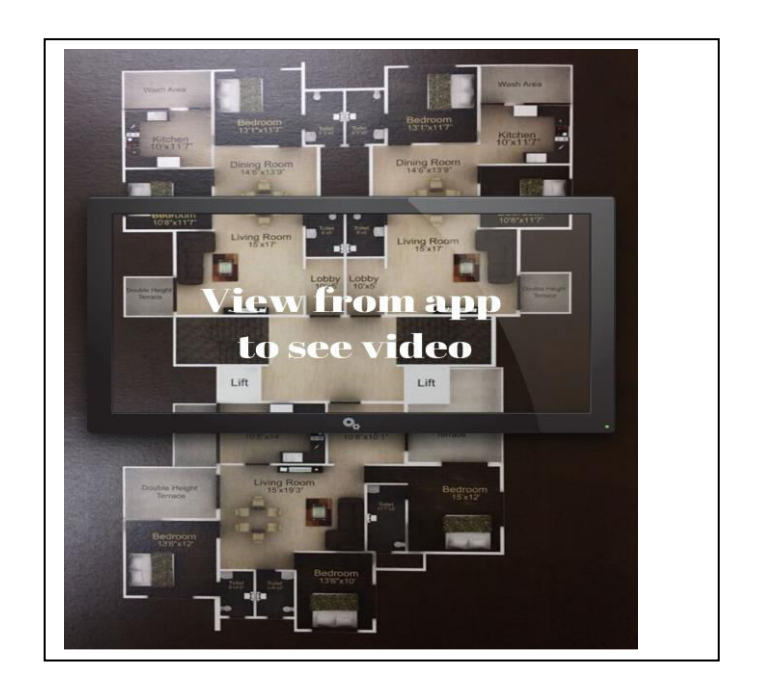
Figure: Target Image II (Internal view of the building)