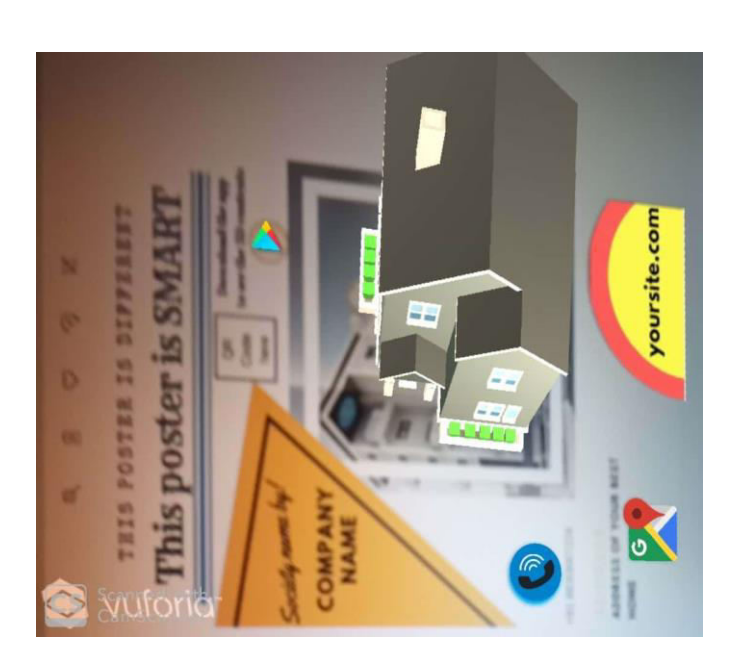
Figure: Target Image I (3-Dimensional Model of building)