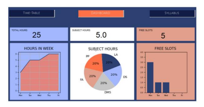
Fig-2: Sample GUI