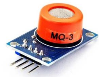
Fig - 3: Alcohol Sensor.

The alcohol sensor serves as a critical component in the system, functioning like a "breathalyzer" for detecting alcohol vapor. It measures the presence of alcohol in the air, and if it exceeds a defined limit, it initiates safety measures to prevent intoxicated driving.