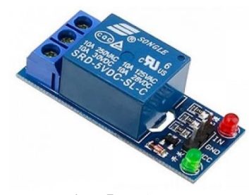
Fig - 5 : Relay 5V.

The relay acts as a switch. It's like a digital gatekeeper, controlling the flow of electricity to various components. When triggered, it can turn on or off devices like the motor, allowing for specific actions to be taken based on the alcohol detection results.