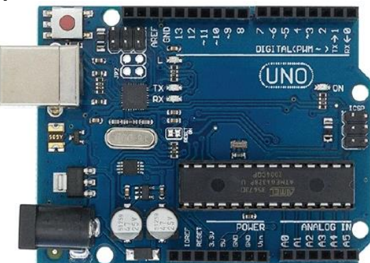
Fig - 6: Arduino ATmega328P.

The Arduino ATmega328P serves as the central processing unit of your project, functioning as the core controller. It processes data, executes logical decisions, and oversees the coordination of all interconnected components. In essence, it acts as the pivotal control unit, managing critical functions such as alcohol detection and the implementation of safety measures.