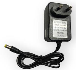
Fig - 2: Power Supply.

The power supply plays a vital role by furnishing electrical power to all electronic components. It meticulously delivers the precise voltage and current required for optimal operation, including sensors and displays. It serves as the essential electrical source that sustains the functionality of the entire system.