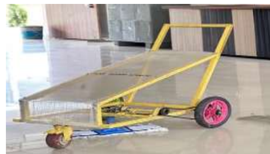
Fig 2. Automatic floor cleaning machine