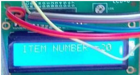
Figure 3: LCD Display

color sorting, color of the object- red or blue or green and final count of the objects – item number which are sorted.