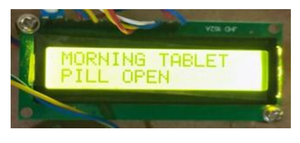
Fig.8.: Display Pic of Morning Tablet that is to be given