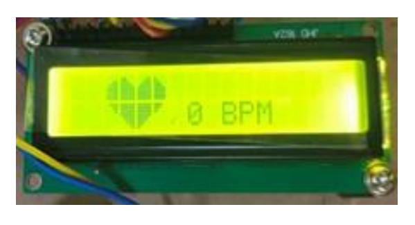
Fig.12.: Heartbeat Sensor Readings