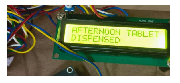
Fig.10.: Display Picture of Afternoon Tablet Dispensary