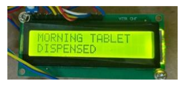
Fig.9.: Display Picture of Morning tablet Dispensary