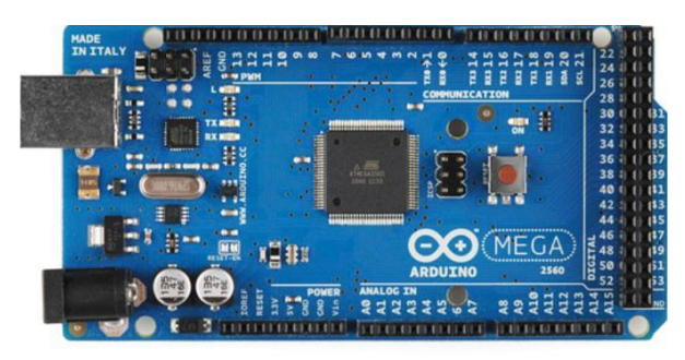
Fig.2. Arduino Mega 2560 for controlling the functions.