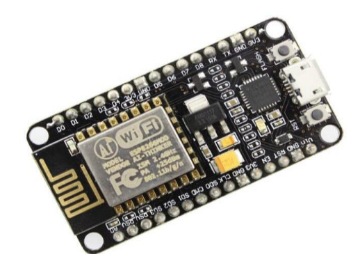
Fig.6.Wifi Module for wireless communication.