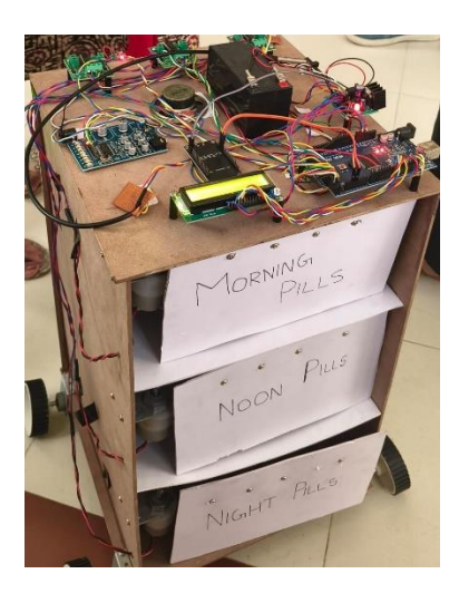
Fig.7.: Hardware setup of the proposal Model