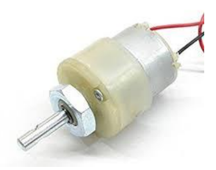
Fig.4. DC Motor to manage the moving parts.