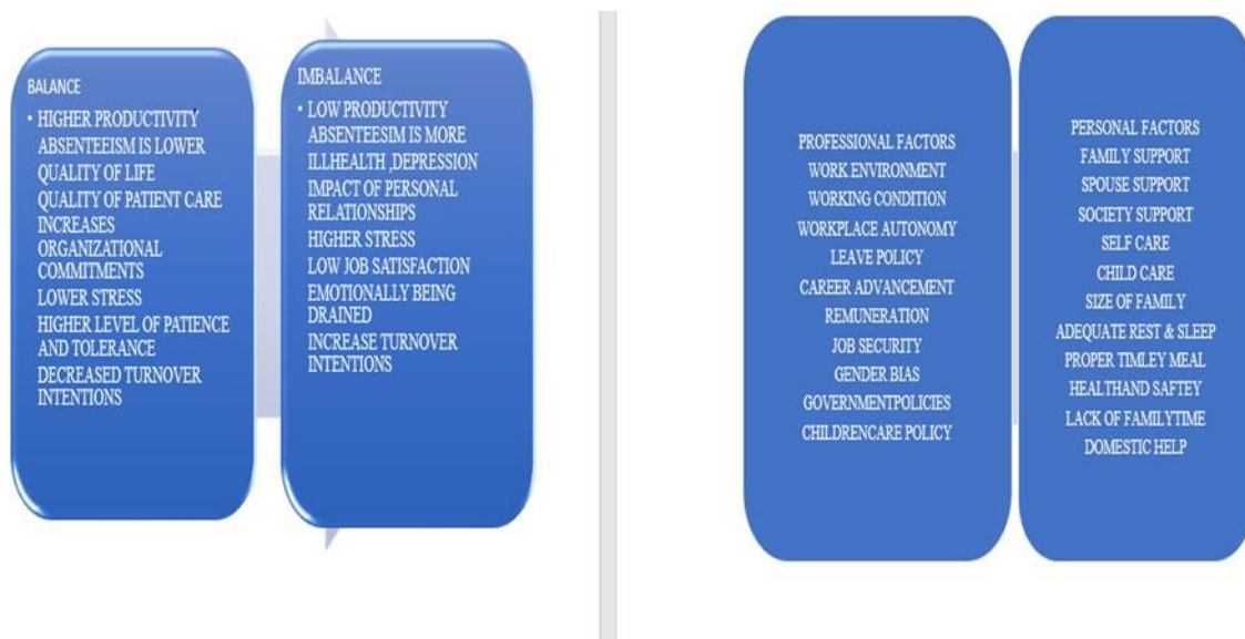
Fig :1&2: Conceptual Framework of Stress-related Factors and Work-life Balance