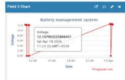
Fig.7.Thingspeak Graph Analysis of Gas value, Temperature and Voltage