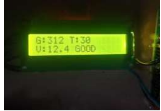
Fig.6.Output when all paraments are in Good condition.