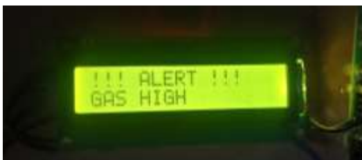
Fig.5.Output on LCD when Gas Sensor Alert