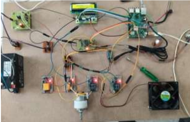
Fig.4.Real Photography of Existing System