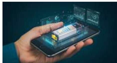
Fig.1.Revolutionizing Battery Management in Mobile Devices using Digital Twin Technology

operational lifespan of the devices they power. However, monitoring and maintaining battery health is often challenging due to factors such as temperature fluctuations, voltage drops, and overcurrent conditions, which can lead to damage or system failure.