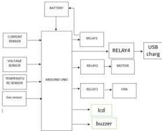
Fig.2.Block Diagram of Proposed Model