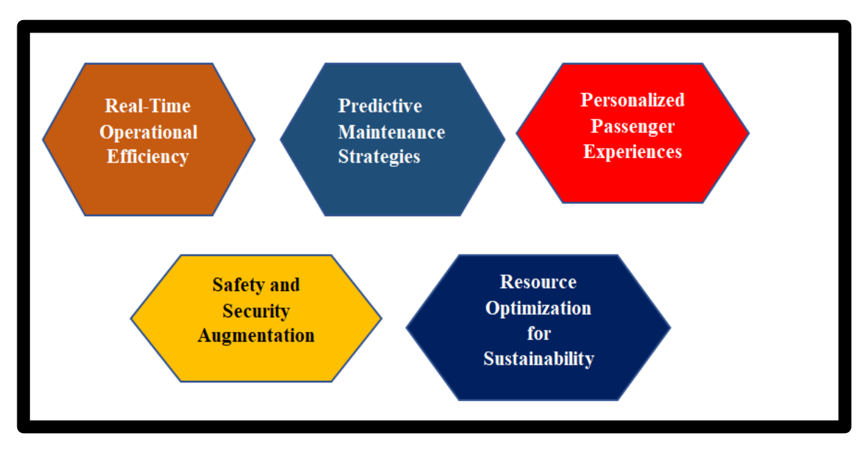
Fig 2: Big Data Revolutionizing Railway Operations

Predictive maintenance is a transformative application of Big Data in railways. Through the analysis of data from sensors and IoT devices, railway companies can predict equipment failures before they occur; enabling proactive maintenance that reduces costs and ensures uninterrupted service delivery.