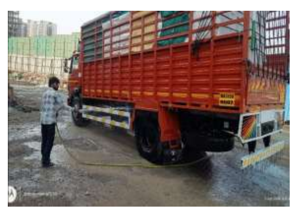
Fig.3.2.6.4.Dust control method