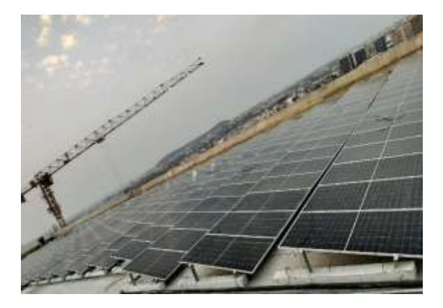
Fig.3.2.6.3.On site solar