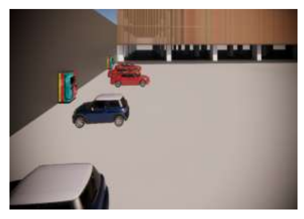
Fig.3.2.6.2.EV charging point