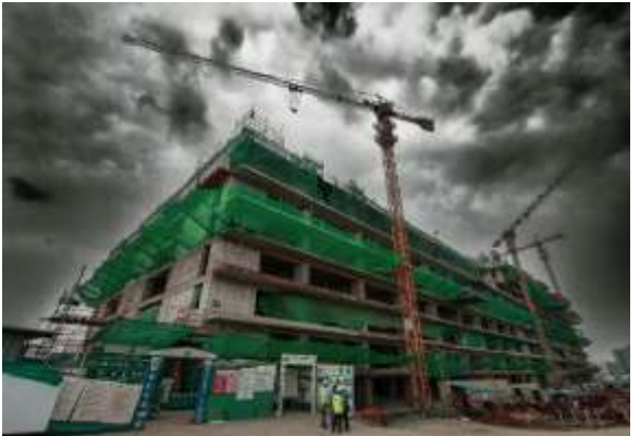
Fig.4.1.1. AP4 Commercial Office Building