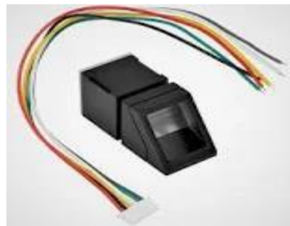
Fig -2: Biometric Fingerprint Sensor

The R307 is a fingerprint sensor unit that communicates through an interface of TTL UART. Users can save fingerprint information inside the unit and organize it to operate in either 1:1 or 1: N style for person verification. The fingerprint unit can be directly connected to a 3.3V microcontroller. However, if you intend to interface it with a PC, you will require a level converter like MAX232. The R307 fingerprint unit offers two ports: USB2.0 & TTL UART. The USB2.0 port is designed for computer connectivity, while the RS232 port operates at a TTL level with a default modem speed of 57600, which can be modified as needed according to the communication protocol. It can be interfaced with various microcontrollers such as ARM, DSP, and other serial devices directly, and it's compatible with both 3.3V and 5V microcontrollers. When connecting it to a computer, you'll need a level conversion circuit, like the one involving a MAX232, to facilitate the communication.