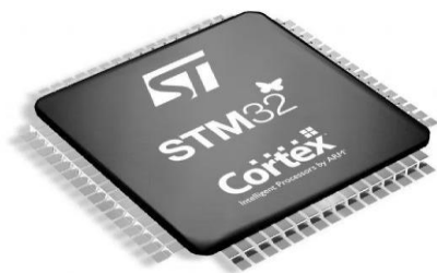
Fig -2: STM32 Microcontroller

differing mainly in the combination of maximum SRAM capacity and peripheral interfaces. At a clock frequency of 72MHz, the microcontroller executes code from the flash memory while consuming a mere 36mA, which translates to an energy consumption rate of 0.5mA per MHz's. A microcontroller is essentially an integrated circuit chip created using Very-Large-Scale Integration (VLSI) technology. It amalgamates a host of essential functions into a single silicon chip, including the (CPU) "central processing unit", (RAM) "random access memory", (ROM) "read-only memory", a range of O/I ports, an interpose system, timers with data processing abilities, counters, and also additional functionalities like A/D converters, display drive circuits, analog multiplexers, pulse width modulation circuits and more. This integration results in a compact and self-contained microcomputer system.