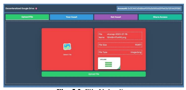
Fig -5.2: File Uploading

The "file upload" process in decentralized systems like Google Drive alternatives allows users to upload and store files securely using technologies like IPFS and blockchain. Upload files. They can browse local files and select files to upload. The system usually supports many file types, including documents, images, and videos, allowing users to select compatible files. Some systems may also provide drag-and-drop functionality that allows users to easily upload files by dragging them into the application interface. Archive Name indicates the name of the selected file, while Archive Size indicates its size in kilobytes or megabytes, which is important for understanding any size limits or associated costs. File Type Confirm the type of file being uploaded (such as PDF or .jpg). In some cases, a cryptographic hash value of the data is generated as a unique identifier to ensure the integrity of the data. To ensure confidentiality and security during storage and retrieval, data can be encrypted before uploading. It is then placed in a shared storage volume such as IPFS, where it is broken into smaller pieces, distributed among nodes, and given a unique value for recovery. A link or content identifier (CID) based on the IPFS file hash, by which users can access or share files.