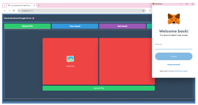
Fig -5.1: Landing Page

MetaMask is a browser-based cryptocurrency wallet that allows users to interact with transactions on the Ethereum blockchain and other blockchain networks. The "Sign Up with MetaMask" feature provides security and user authentication, making it ideal for services like Google Drive sharing. Users