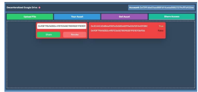
Fig -5.4: Share Access

In a decentralized storage system, shared access to information is securely controlled and authorized, typically using blockchain technology and smart contracts. This ensures that the sharing process is transparent, secure, and auditable. This can include direct sharing or selecting specific users for access. When