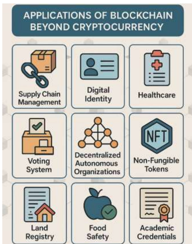
Fig.3 Applications of Blockchain Beyond Cryptocurrency