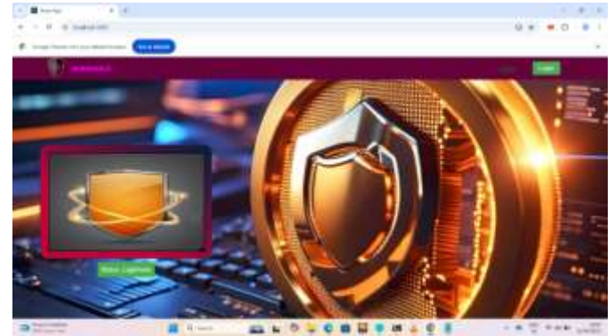
Fig 4.2 - Result

It has one button named "Choose file", implying that this page lets users upload files—perhaps for scanning, its shows whether it shows legitimate or not, or safe storage as one of the protective aspects of RANSHIELD.