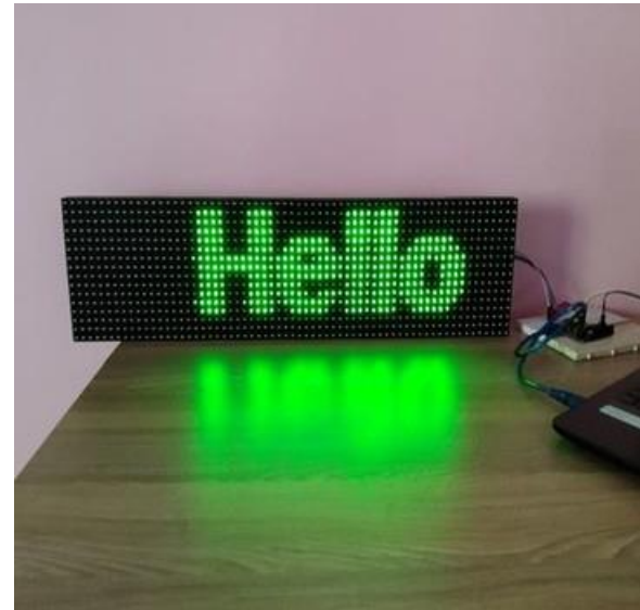
Fig. 3. Result