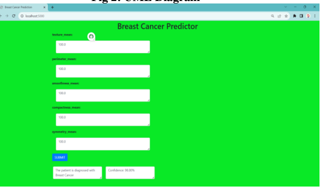
Fig 3: Result