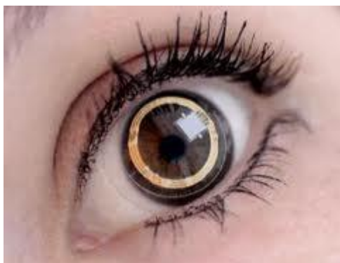
Fig.1.1-Rotation in Eye

1). One type uses an attachment to the eye, such as a special contact lens with an embedded mirror or magnetic field sensor, and the movement of the attachment is measured with the assumption that it does not slip significantly as the eye rotates. Measurements with tight-fitting contact lenses have provided extremely sensitive recordings of an eye the dynamics and underlying physiology of eye movement.