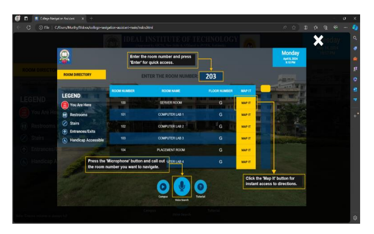
User interface page