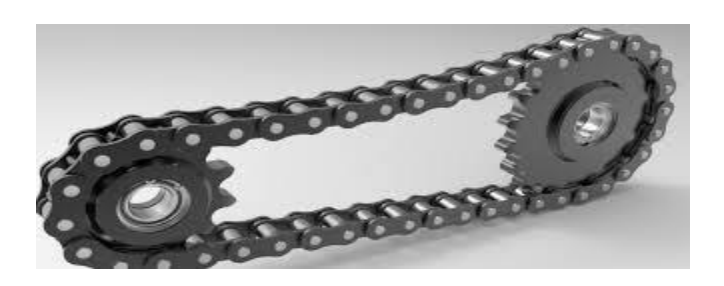
Figure 4: Chain Drive

Volume: 06 Issue: 08 | August - 2022 | Impact Factor: 7.185 | ISSN: 2582-3930