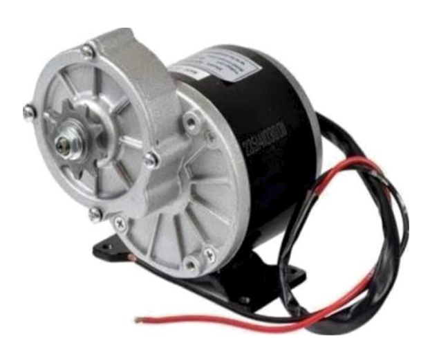
Figure 2: Motor