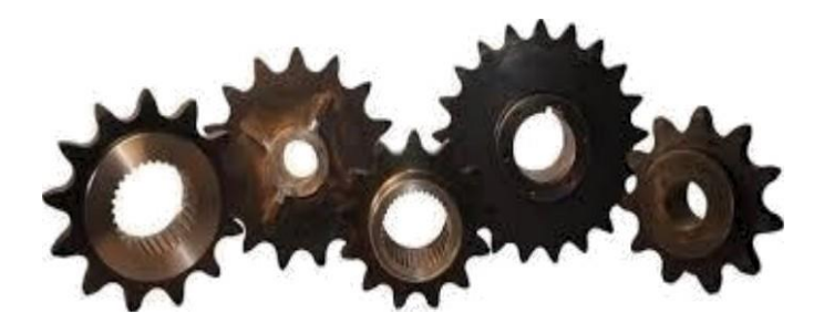
Figure 6: Sprockets

The chain with engaging with the sprocket converts rotational power in to rotary power and vice versa. The sprocket which looks like a gear may differ in three aspects: