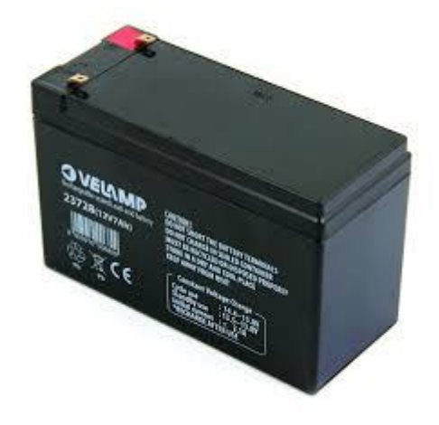
Figure 3: Lead acid Battery

The battery also acts as a condenser in a way that it stores the electric energy produced by the generator due to electrochemical transformation and supply it on demand. Battery is also known as an accumulator of electric charge. This happens usually while starting the system.