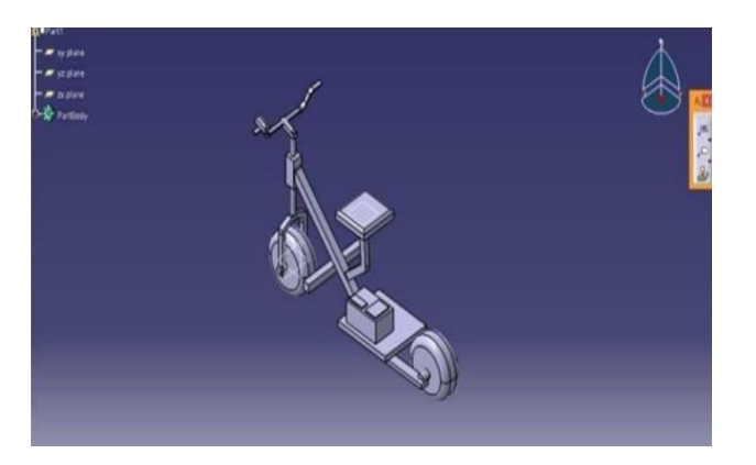
Figure 1: Design of Chain Drive Electric Bike