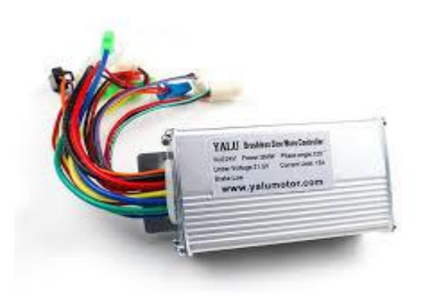
Figure 5: Controller

Motor controllers may use electromechanical switching, or may use power electronics devices to regulate the speed and direction of a motor. Motor controllers are used with both direct current and alternating current motors. A controller includes means to connect the motor to the electrical power supply, and may also include overload protection torthe motor, and over-current protection for the motor and wiring. A motor controller may also supervise the motor's field circuit, or detect conditions such as low supply voltage, incorrect polarity or incorrect phase sequence, or high motor temperature. Some motor controllers limit the inrush starting current, allowing the motor to accelerate itself and connected mechanical load more slowly than a directconnection.