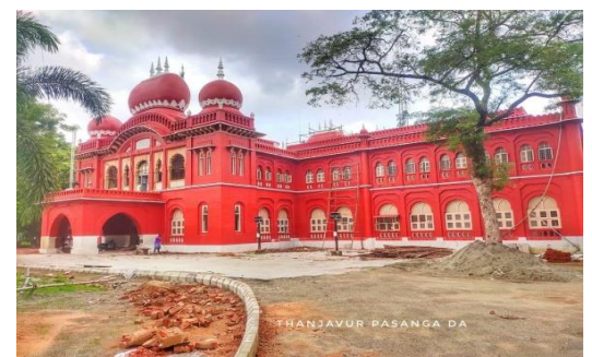
Fig 5 : Old Collector Office(Author)