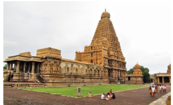
Fig 6 : Brihadeeswarar Temple (Author)