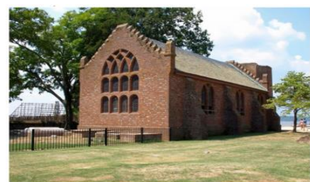
Fig 2 : The reconstructed Jamestown Church, Jamestown

It means and includes returning a place as nearly as possible to a known earlier state and distinguished by the introduction of materials (new or old) into the fabric. New material may include recycled material salvaged from other places. This should not be to the detriment of any place of cultural significance. This shall not include either recreation or conjectural reconstruction. [4]