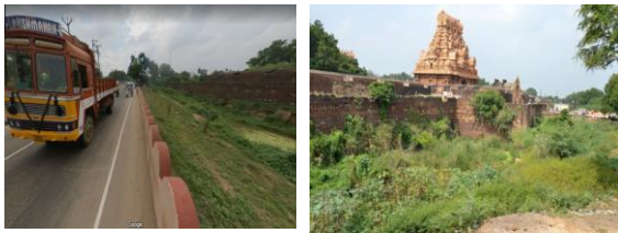
Fig 8 : Brihadeeswarar Temple fortified wall