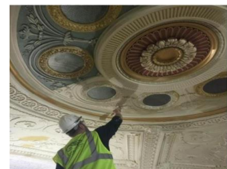
Fig 1 : Restoration