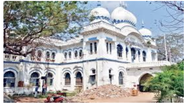
Fig 4 : Old Collector Office(Author)