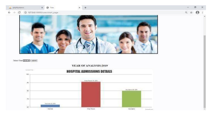
Fig. 3. Graphical Analysis page