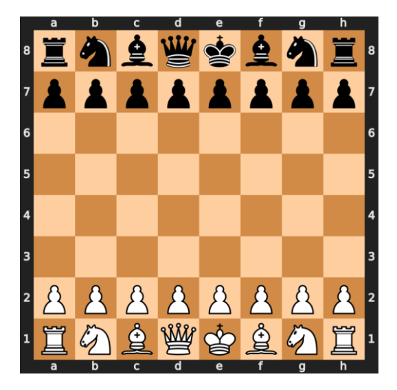
Figure 1: A standard chess board

This paper now explores some mathematical problems involving the chess board. There are several questions that may be constructed, and students can create their own questions and then answer them. Thus , chess also fosters creativity (Ortiz et al., 2019). For example, how many combinations are possible for the starting move of both black and white?