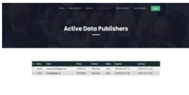
Fig 8: Figure of Active Data Publishers Page