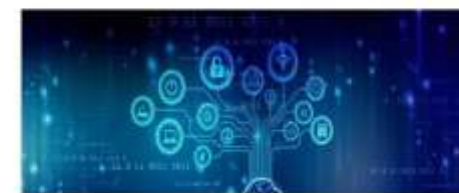
Fig 6: Figure of Authority Home Page