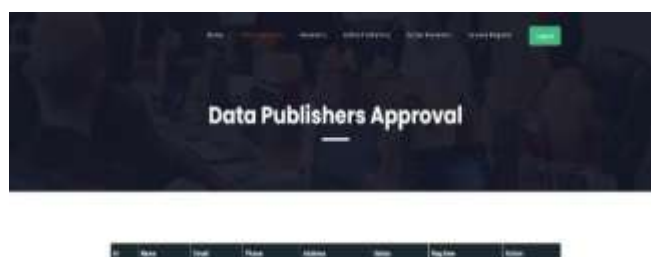
Fig 7: Figure of Data Publishers Approval Page