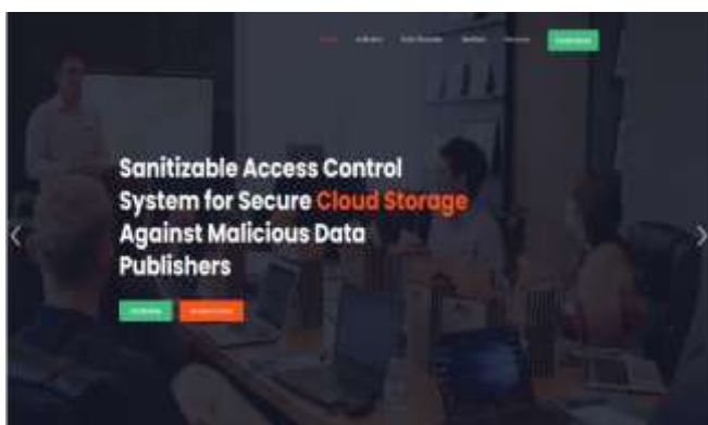
Fig 2: Figure of Home Page