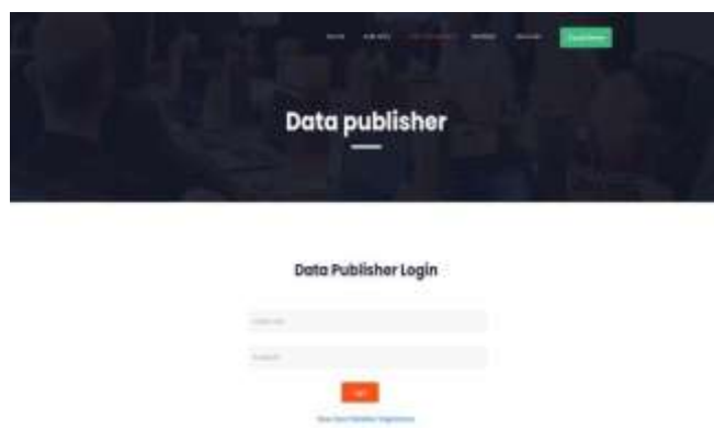
Fig 5: Figure of Data Publisher Log-in Page