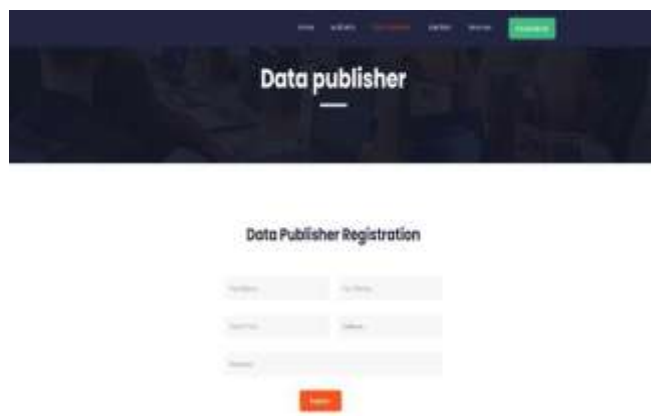
Fig 4: Figure of Data Publisher Registration Page