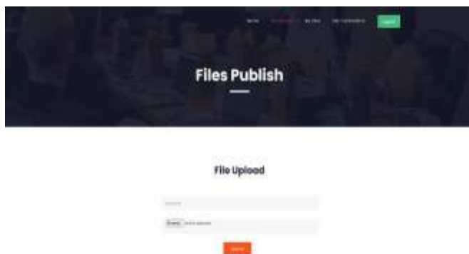
Fig 9: Figure of Uploading files Page