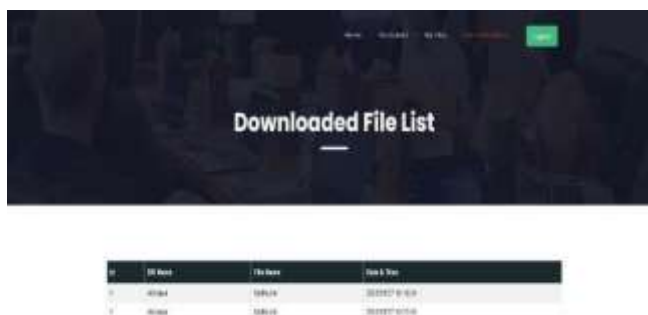
Fig 11: Figure of Downloaded File List