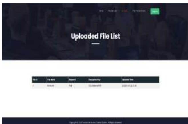
Fig 10: Figure of Uploaded File List Page