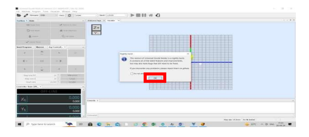
Fig. Universal G Code Software Interface

Click on connect option \rightarrow connection done \rightarrow Run G code