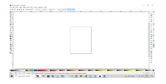
Fig. Inkscape Software Interface

Click on extension \rightarrow 4XI draw tools \rightarrow Generate G code tool \rightarrow give path to save G code \rightarrow click on apply