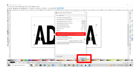
Fig. Generated G Code

Click on extension \rightarrow 4XI draw tools \rightarrow Generate G code tool \rightarrow give path to save G code \rightarrow click on apply