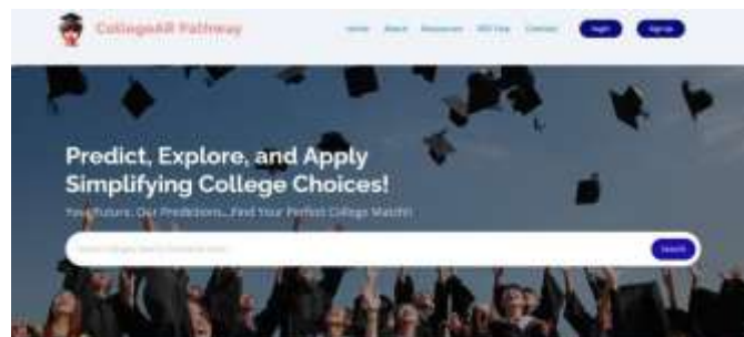
Fig – 1.1 Home Page

Level of Detail (LOD): Adjust image quality based on user zoom level or performance.