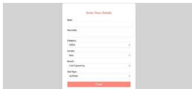
Fig - 1.3 User Input (Model 1)