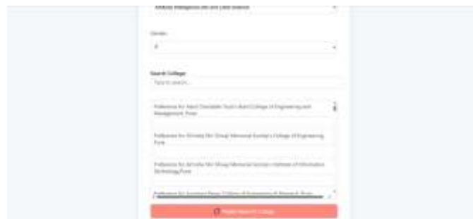
Fig - 1.5 User Input (Model 2)