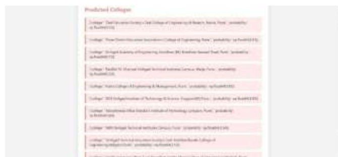
Fig - 1.4 Output Of Model 1