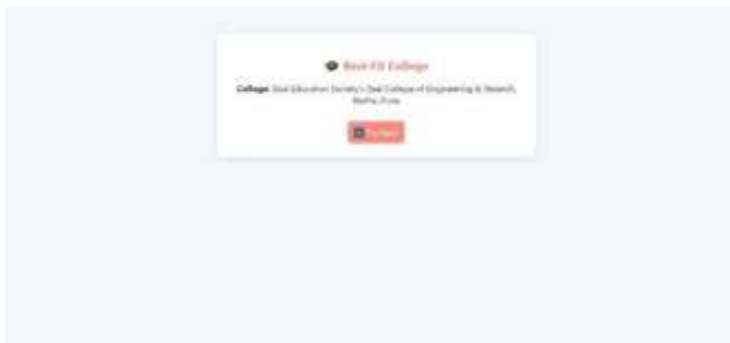
Fig - 1.6 Output Of Model 2