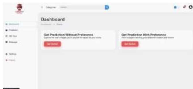
Fig - 1.2 Dashboard