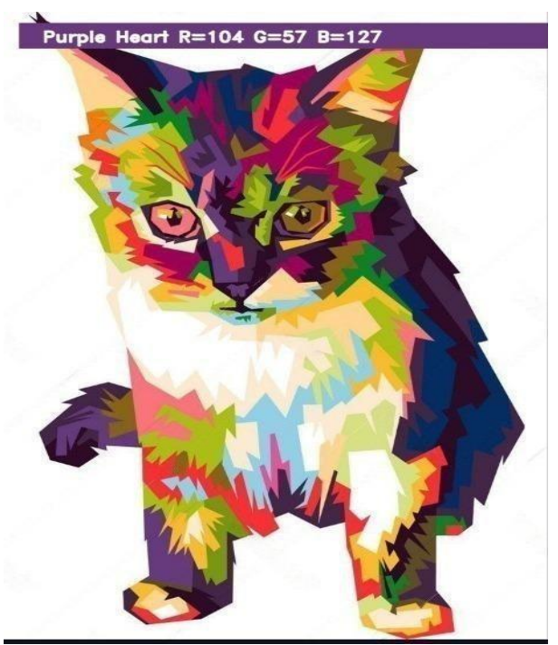
FIG: 4.1 OUTPUT SCREEN

attractive to the viewer. We have built-in extra features for this. Here we talk about the two most common approaches. We have the Str.format() method with the Format() function, the output looks better. The accompanying braces { } in the code are passed as wildcards. By putting numbers as placeholders, we can also specify the order in which these variables are displayed The print command is the most basic way to print. To end the print line with a new line, add a print statement without objects. It prints to any object, including file objects, that implements write().