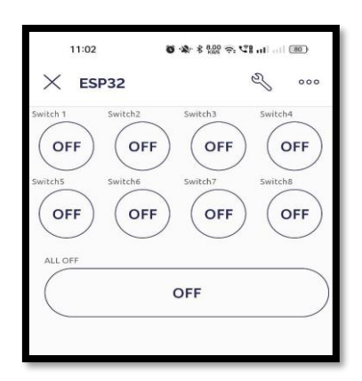
Fig.1 Blynk app

Buttons of IR remote will have hex codes. These hex codes will differ from button to button. In order to control home appliances through IR remote we should know those hex codes. To get these hex codes we will use IR receiver connected to esp32.Upload a code to esp32 to get hex codes of IR remote from IR receiver. Code will be available in google. After uploading the code, the IR receiver will detect the hex codes from buttons when pressed and those hex codes will be displayed in serial monitor.