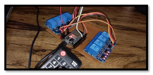
Fig.3 Home Automation device

If WIFI is not available we can monitor the 8-relay module with IR remote, Bluetooth and also switches manually.