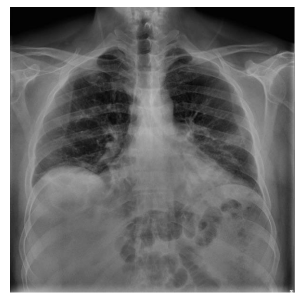
Covid Positive Image