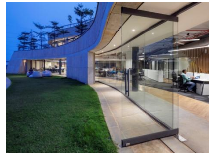
Fig. 2. Image explains workspace connect with greenery