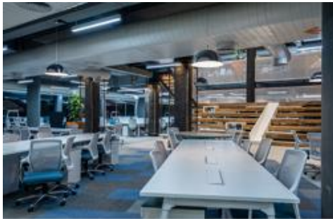
Fig.9 . Image explains meeting space and open workspace.

The meeting room and collaborative spaces are usually open to the atrium. The circulation overlooks the atrium in the middle and is more generally private to the office.