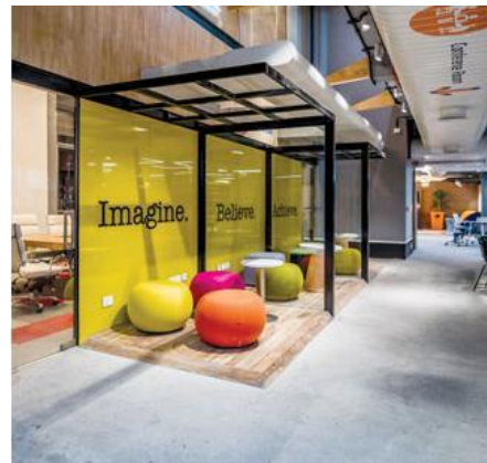
Fig.7. Image explains Breakout space with comfortable furniture

Comfortable furniture and interactive surfaces help bring down stress levels and increase employee retention.