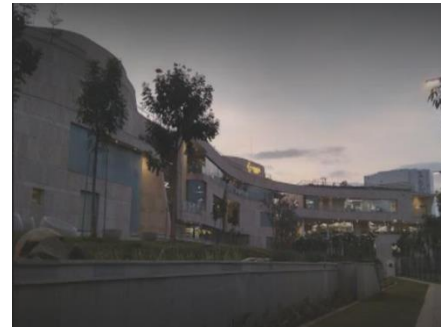
Fig.1. Image explains office exterior

In an activity-based working space ,employees tend to move around more throughout the day instead of sitting in one place. Even these small increases in physical activity can help improve an employ's health.its is sharing workspace with other organization or with person,