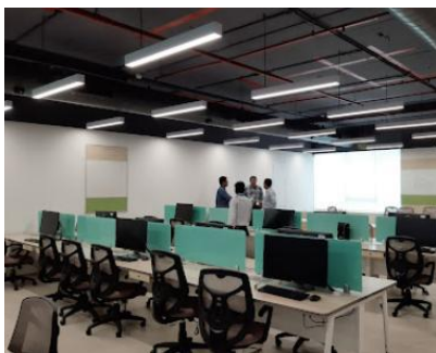
Fig. 10. Image explains open work station in IT

IIT Research park endeavor to enable companies with a research focus to set up a base in the park and leverage The expertise of it madras, the park is located on a site adjacent to the IIT madras campus.maximum floor plate area- 3,300 sq m partitioned between 1-8 tenants .amenities like food court, ATM and coffee shops facilities to be added in phase 2 , food court, fine dining restaurant, multi purpose hall, indoor recreational facilities, etc .interactive wall are created in reception including meeting rooms, seminar halls are on the ground floor the open work spaces are provided.