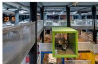
Fig. 8. Image explains Meeting space in container