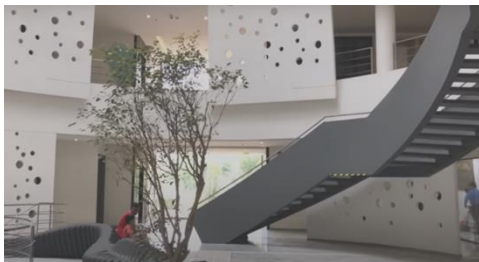
Fig.5. Image explains informal meeting space

in the atrium space which separates office work spaces. The central spine along the clear water body edge is a linear double height space integrated with a series of wide steps, courtyards,