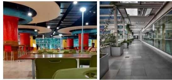
Fig. 11. Image explains Breakout cafeteria and green walk way

Meeting space as communal space has a large meeting room and a , multi purpose hall.