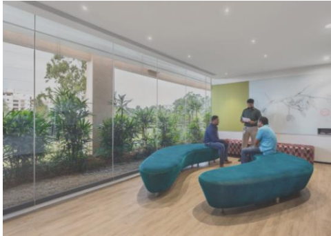
Fig. 4. Image explains informal meeting space

Meeting space as communal space, seating, and atrium spaces are used as informal meeting spaces.