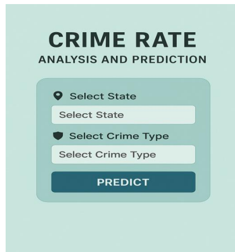
Fig. 2: fug 1

Model struggles with rural area predictions due to sparse data.