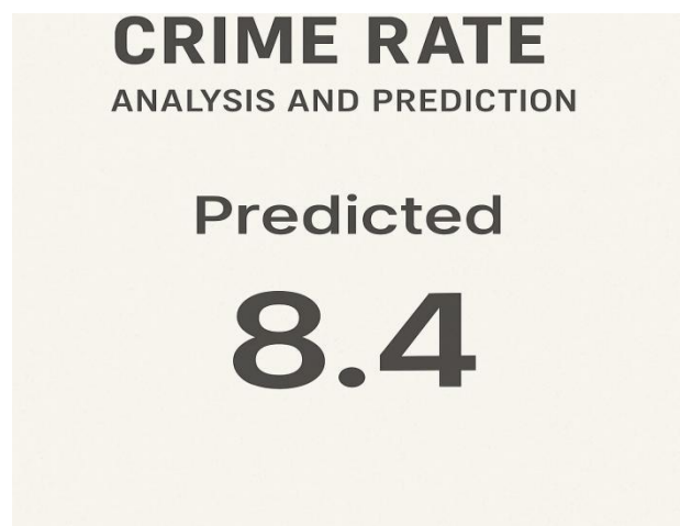
. Fig. 3: fug 2