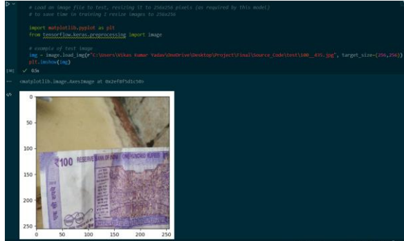
Fig. 3 Testing the model

accuracy and fast processing time make the system suitable for real-time use by visually impaired individuals.