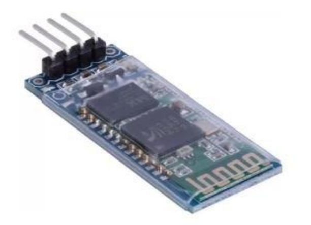
Fig 3.Bluetooth module HC-06.

The HC-06 Bluetooth Module is a wireless serial communications Class 2 slave module. When the module is connected to a primary Bluetooth device (such as a computer, smartphone, or tablet), the transmission becomes completely