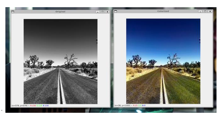
Fig 2: Colorized Image Display