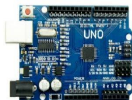
Fig 5: ARDUINO UNO Board

The Arduino Uno is a popular open-source micro-controller board based on the ATmega328P micro-controller chip. Here