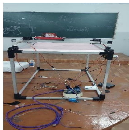
Fig 7: Set up of project