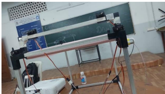
Fig 8: Side view of project

Journal of Research Publication and Reviews, Vol 3, no 5, pp 150-159, April 2022, ISSN 2582-7421, pp- 150-159