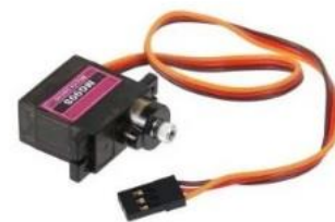
Fig 6: 60 RPM DC Geared Motor

A direct current (DC) motor with a gear reduction mechanism that produces an output shaft rotation speed of 60 revolutions per minute is known as a 60 RPM (Revolutions Per Minute) DC Geared Motor. These motors are frequently employed in many different applications where a particular torque and speed are needed.