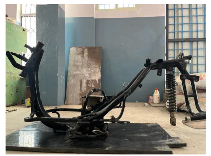
fig.3: Side view of the chassis