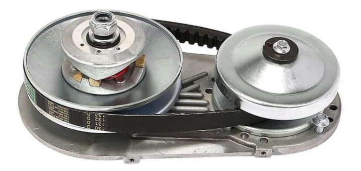
fig.9: CVT Transmission

The below fig.9 shows the continuously variable transmission.