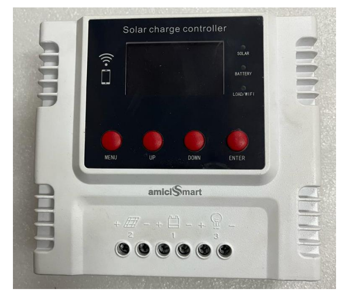
fig.8: MPPT kit (Solar Charge controller)

The fig.8 below shows the 48V 40A MPPT device.