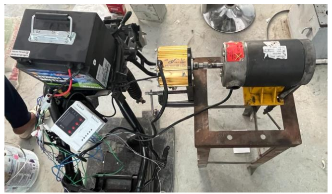
fig.10: Pre-testing setup

The fig.10 below shows the setup on a table.