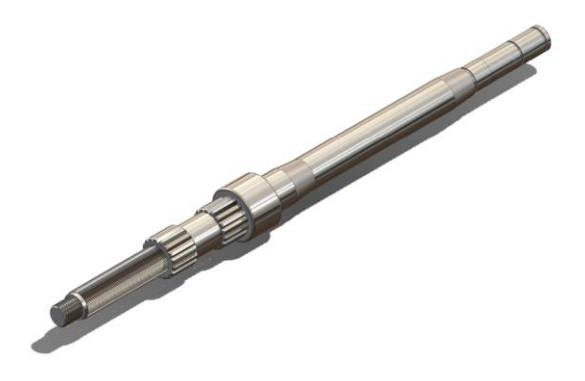
fig.5 : Redesigned Shaft

The fig.5 and fig.6 show the shaft and BLDC motor respectively.