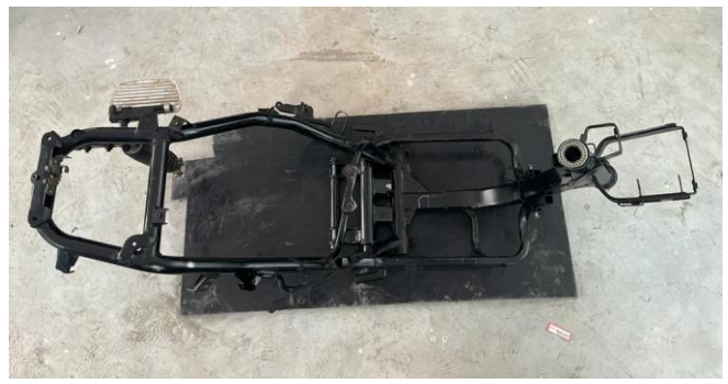
fig.2: Top view of the chassis

Fig.2 and fig.3 show the top and side view of the framework of chassis respectively.