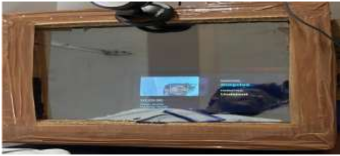
Fig 2: Emotion is Surprise and Hairstyle is Under cut

The image illustrates the functional operation of an intelligent smart mirror system that combines embedded hardware with real-time image processing and IoT-based data display. The system is built using a two-way reflective mirror with a display panel positioned behind it, enabling digital information to appear on the mirror surface without obstructing the user's reflection. A camera module mounted on the frame captures live video input of the user, which is continuously processed by a central computing unit such as a Raspberry Pi. The system operates by detecting and tracking the user's face using computer vision algorithms. A bounding box is visible around the detected face, indicating that facial detection is actively being performed. Once the face is detected, the system applies emotion recognition techniques using machine learning models trained on facial expression datasets. The detected emotion in this instance is displayed as "surprise," demonstrating the system's ability to interpret facial features such as eye movement, mouth shape, and overall expression patterns.