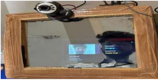
Fig 4 : Emotion is Angry and Hairstyle is Crew Cut

The image demonstrates the real-time functioning of an intelligent smart mirror system that integrates a two-way mirror with embedded computing, computer vision, and IoT-based sensing. The mirror allows simultaneous reflection and display by placing a digital screen behind a semi-transparent reflective surface. A camera module mounted on the frame continuously captures the user's facial image, which is processed by a central unit such as a Raspberry Pi to enable interactive features. The system utilizes face detection algorithms to locate the user's face, as indicated by the highlighted bounding box around the facial region. Once the face is detected, advanced image processing and machine learning models analyze facial landmarks and expression patterns to determine the emotional state of the user. In this instance, the system identifies the emotion as "fear," showing its capability to distinguish subtle variations in facial expressions through trained classification models. Based on the detected emotion, the system provides personalized recommendations, such as suggesting an appropriate hairstyle like "undercut." This demonstrates the integration of artificial intelligence with decision-making logic to enhance user interaction by delivering context-aware suggestions. The system thus functions not only as a reflective surface but also as an intelligent assistant capable of interpreting user behavior.