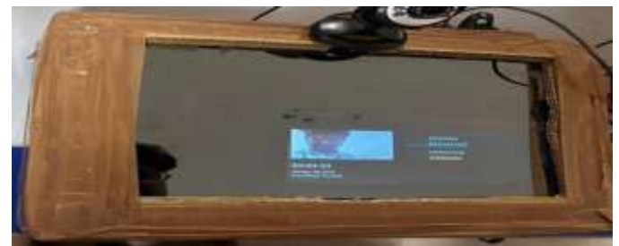
Fig 1: Emotion is Neutral and Hairstyle is Classic

This captured data is processed by a microcontroller or a single-board computer such as a Raspberry Pi, which acts as the core processing unit of the system. The working principle is based on computer vision and image processing techniques, where the camera continuously monitors the user's face.