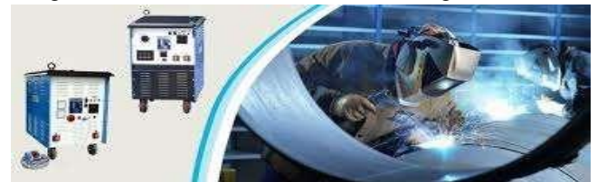
Fig. 1: CO2 welding for pipes

In CO 2 welding or sometimes electric arc welding the need often arises for welding of circular shape components, where the welding is carried out on the entire periphery or a partial arc length of the job. The electrode is thus moved along this circular path in the conventional method. However, movement of the electrode is much more difficult and it is much easier to index the job. For welding the current work piece Cycle, time is higher .i.e. 45-60 sec. So need to develop such a system for easy work piece loading and & auto welding gun positioning. Auto ON/OFF the switches of welding machine to achieve the smooth working.