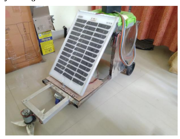
Fig. 3. Project Model