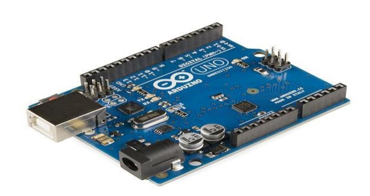
Fig- 3.1: - Arduino Uno

The Arduino Uno is a microcontroller board developed Arduino-designed ATmega328P Microchip on the microprocessor, offered as open-source hardware. It boasts analog input/output (I/O) pin sets that facilitate interfacing with various expansion modules and circuits. Featuring 14 digital I/O pins (six with PWM capability) and 6 analog I/O pins, the board is programmable through the Arduino Integrated Development Environment (IDE). The term "Uno" originates from Italian and signifies the launch of Arduino Software (IDE) version 1.0 and the corresponding Uno board. Initially introduced as the flagship Arduino USB board, the Uno board serves as the foundation for subsequent Arduino iterations and advancements in the platform.