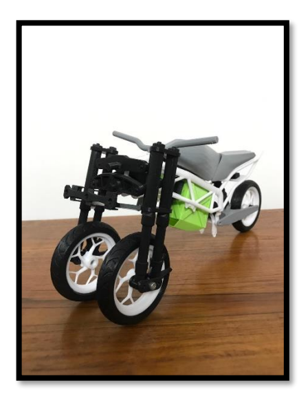
Fig --2: 3D- Printed tilting trike.

They disassembled the front suspension. Parts such as the head, forks, wheels, etc. are disassembled. There are two additional forks gathered. To create a single suspension, two of them are connected. When two forks are joined, they become stronger than when one is used alone. The wheels and dual fork suspensions are then attached. After that, the two front plates are securely fastened. With the aid of iron bars, the UCT bearings are now welded firmly one beneath the other. This is the bearing that the parallelogram link is fastened to. There are two vertical and two lateral linkages in the tilting mechanism. The vertical links are composed of the fork suspension. Every UCT bearing has two lateral link centers fastened to it. The entire assembly is fastened or welded when the caser and camber angles are correctly set.